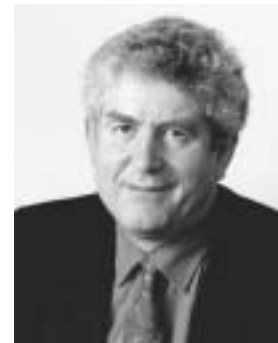
Rt Hon Rhodri Morgan AM First Minister for Wales